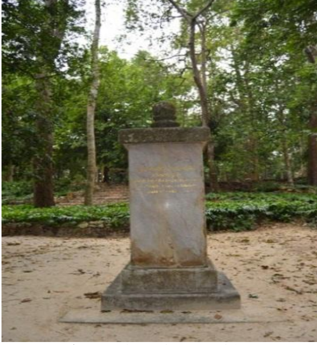
Fig. V: Body Burning Memorial [9]

at the top. It has four aspects and each one is fifty in width and one and fifty meter in length. Each aspect is written in four different languages, if walking along clockwise direction, i.e. Pāli, English, Thai, and Chinese. In the pillar it appears the messages as followings: here is the cremation of Buddhadasa Bhikkhu (Phra Dhamma Kosacariya), corresponding on 28<sup>th</sup> September, 1993 on Tuesday, the 13<sup>th</sup> of waxing moon in the 10<sup>th</sup> of lunar month.'