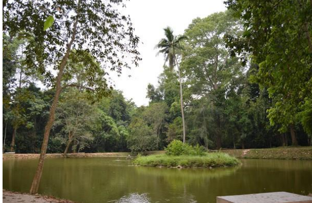
Fig. XII: Nalike Pond [17]

Beside of the hall for meals it has a pathway to one of the important place at Suan Mokkh. Here is Nalike Pond which is in rectangle area and one hundred meter in width and two hundred meters in length. The pond is covered by algae. In the center it has a small island around five square meters where is overspread by grass. The sole coconut tree about twenty to thirty meters grows up there. It has an explanation that 'there is a memorial of earnest Dhamma practice of grandparents in ancient time, in Thai old lullaby states that: Nalike coconut tree is lonely in the sea of beeswax. No rain, no thunder, stay in middle of sea of beeswax. It will be reached there by sage man only. The meaning is that Nibbana is present amidst samsara.'