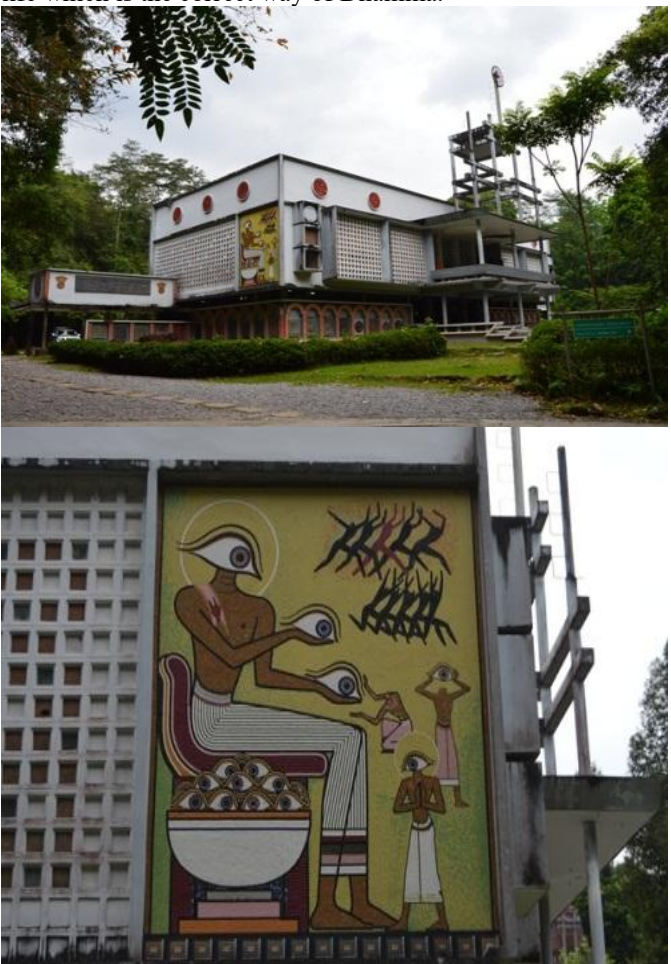
Fig. III: Spiritual Theater and Picture of Distributing the Dhamma Eyes [5]

from different periods and countries for cultivating wisdom of people who come to get tasting of Dhamma instead of sexuality. If Dhamma comforts them to feel good, they are able to escape from sexuality and prefer a beautiful monastic life which is the correct way of Dhamma.'