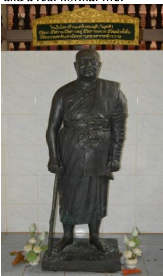
Fig. X: Buddhadasa Bhikkhu's Statue within Sala Dhamma Ghosana Pavilion [15]

Floating bones in river and scattering on mountain are concerned with Dhamma puzzle. It just signifies that body returns to the nature. It becomes to four elements, namely earth, water, fire, and wind. It is the way to learn Dhamma from the nature and a real normal life.