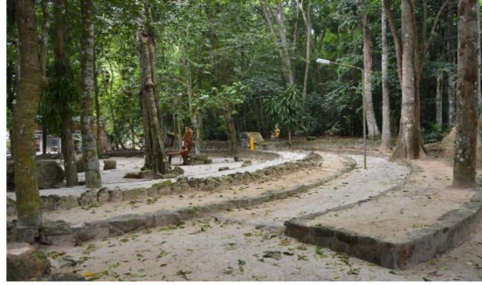
Fig. II: Curved Stone Court [4]

A lot of signs show the meaningful places at monastery, one of them is Curved Stone Court which has an explanation that 'it is one symbol of Suan Mokkh which is most suitable for practicing Dhamma; it is reflection of Buddhadasa Bhikkhu's ideal on what he needed people to practice at Suan Mokkh through talking with a tree and stone and learning conditioned things (Sangkhata Dhamma) and unconditioned things (Asangkhata Dhamma); nowadays here is the place for demonstrating alms giving, chanting, preaching, and meditating; all activities will start at 4:30 a.m.'