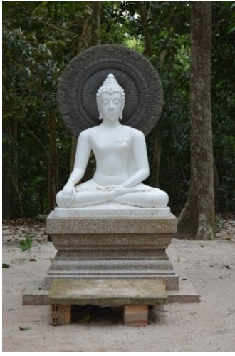
Fig. VII: White Buddha's Statue within Uposatha [11]

The sign of monastery explains that 'it is the ground Uposatha along the nature like in Buddha's lifetime, around by the trees are wall, white clouds in the sky are ceiling, the treetops shaking along the wind are alive gable apexes. This place is for doing monks' services, considering all precepts, and candle light to walk clockwise proceedings. The lower ground is the place to burn Buddhadasa Khikkhu's body.'