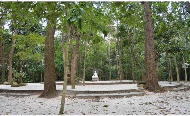
Fig. VI: Natural Uposatha [10]

The sign of monastery explains that 'it is the ground Uposatha along the nature like in Buddha's lifetime, around by the trees are wall, white clouds in the sky are ceiling, the treetops shaking along the wind are alive gable apexes. This place is for doing monks' services, considering all precepts, and candle light to walk clockwise proceedings. The lower ground is the place to burn Buddhadasa Khikkhu's body.'