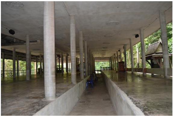
Fig. XI: A Hall for Meals [16]

Beside of the hall for meals it has a pathway to one of the important place at Suan Mokkh. Here is Nalike Pond which is in rectangle area and one hundred meter in width and two hundred meters in length. The pond is covered by algae. In the center it has a small island around five square meters where is overspread by grass. The sole coconut tree about twenty to thirty meters grows up there. It has an explanation that 'there is a memorial of earnest Dhamma practice of grandparents in ancient time, in Thai old lullaby states that: Nalike coconut tree is lonely in the sea of beeswax. No rain, no thunder, stay in middle of sea of beeswax. It will be reached there by sage man only. The meaning is that Nibbana is present amidst samsara.'