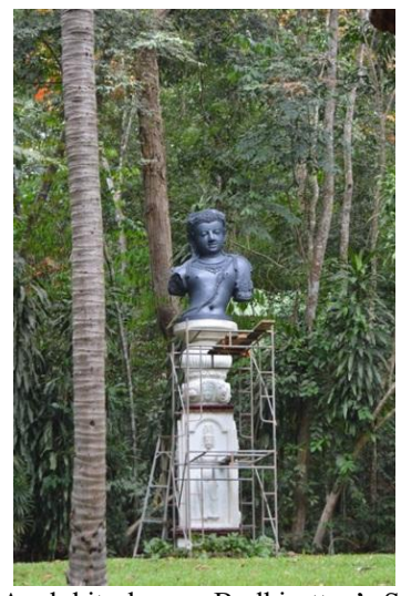
Fig. IX: Avalokiteshavara Bodhisattva's Statue [14]

The reason that Buddhadasa Bhikkhu exhibits Bodhisattva's statue at monastery is that concerned with belief of Srivijaya Kingdom, the old kingdom of Chaiya city which believes in Mahayana Buddhism before. Also, his idea is strongly influenced by Zen Mahayana. Mahayana believes in Bodhisattva and practice goodness in order to become the Bodhisattva. Then, the basic concept of Mahayana emphasizes on Paññā and Mettā to help people escaping from sufferings more than finding the way like Theravada which emphasizes on the purity by escaping from sufferings himself first, then help people later.