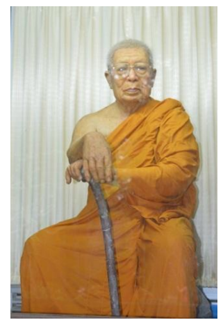
Fig. VIII: Buddhadasa Bhikkhu's Statue within Kuṭi Acariya Building [12]

you look at Avalokiteshavara's face and then it will make us feel comfortable.'